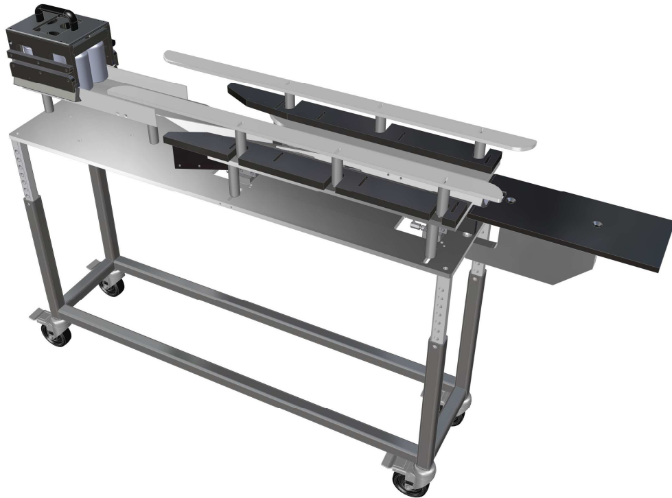
Table-Top Wrap Locking Module